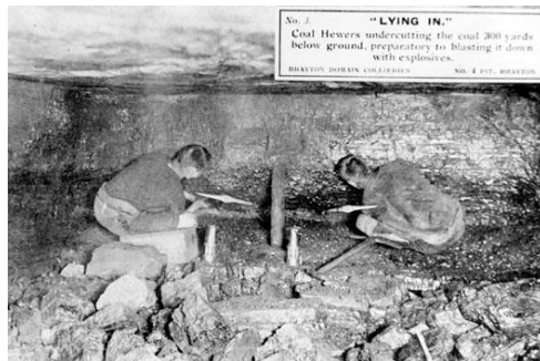
Coal hewers, Brayton Domain Colliery, c.1895 9