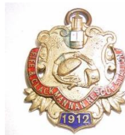
Fife and Clackmannan Rescue Station medal, 1912 7

The majority of acts of courage performed by rescuers remain unsung. However, occasionally they were recognised by some kind