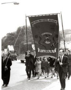
Monktonhall Miners Deputies and Tradesmen banner, 1967 8

Amongst its holdings are collections from: The National Association of Colliery Overmen, Deputies and Shotfirers (NACODS); NUM; and The Miners' Federation of Great Britain.