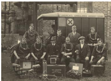
Roslin Colliery Rescue Brigade c.1920s 6

Until the establishment of the Mines Rescue Service in the early years of the twentieth century, mines were reliant on volunteers to rescue their colleagues and bring out casualties during a disaster. In the second half of the nineteenth century the large number of major accidents led to the setting up of a Royal Commission to improve standards of safety. The first dedicated mines rescue services were set up in the early twentieth century, e.g. in Cowdenbeath, Fife (1909). The Coal Mines Act (1911) made such services compulsory within 15 miles of most mines.