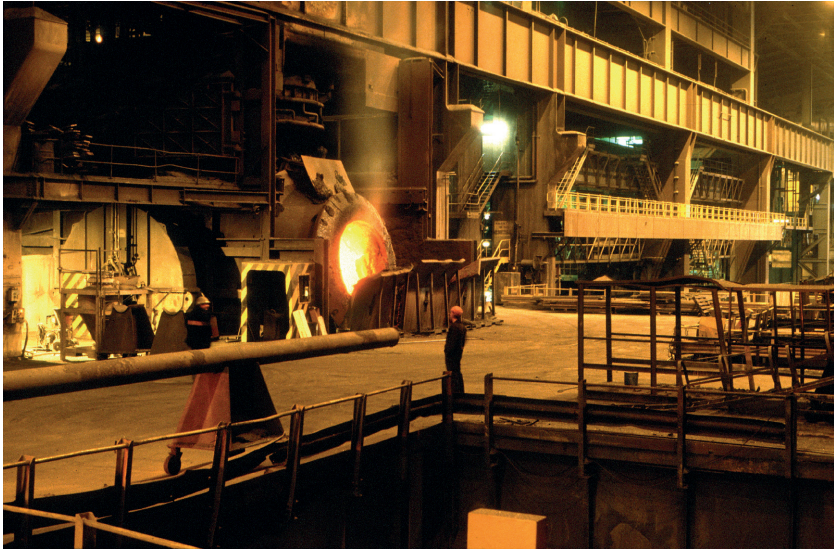
Plate 5 Interior of Ravenscraig steelworks, Motherwell, Lanarkshire, 1985-86.