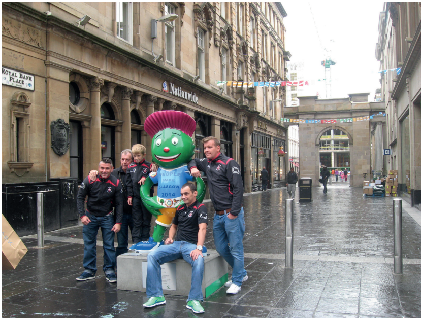
Plate 8 Fieldwork photograph, taken during the Glasgow 2014 Commonwealth Games, on 1 August 2014.

in the Whitelee Plateau where the counties of Ayrshire, Lanarkshire and Renfrewshire meet.