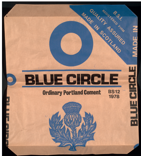
Plate 6 Paper bag used at the Blue Circle Cement factory, Dunbar, East Lothian.