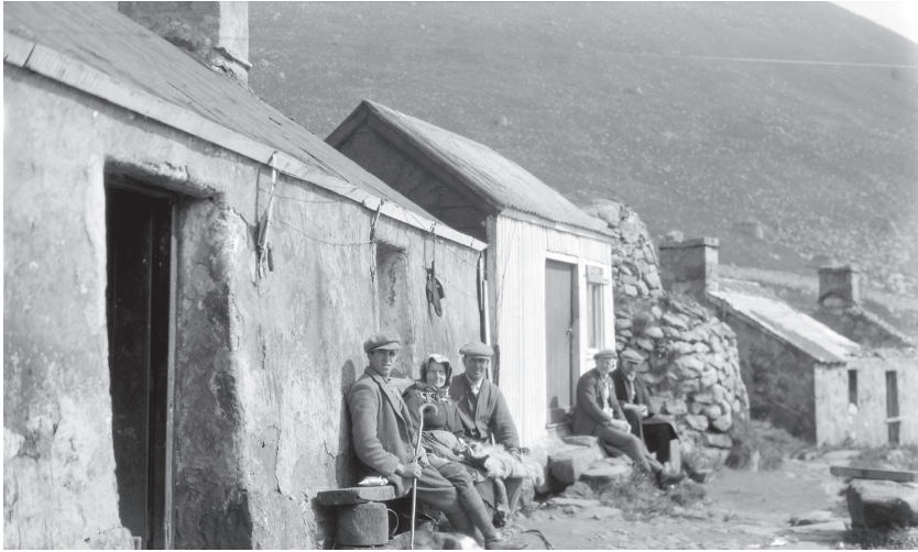
Plate 3 Outside the Post Office, St Kilda, Inverness-shire, taken in 1930 by Alasdair Alpin MacGregor.